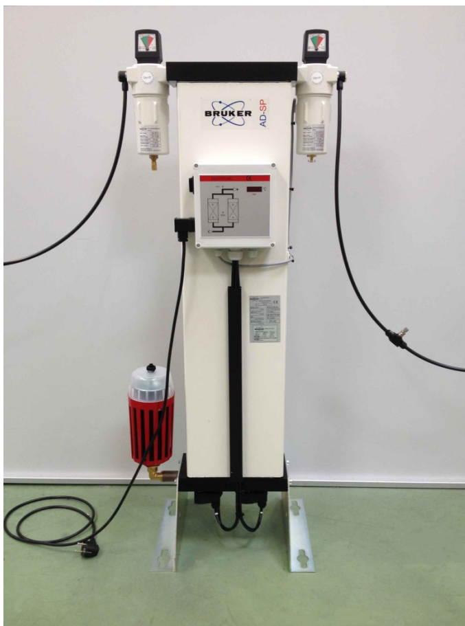
Figure 7.1: Dryer with Buffer with Flow Limiter