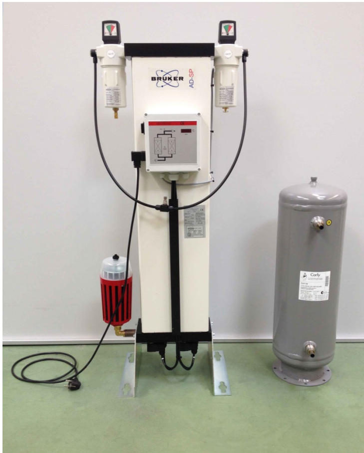
Figure 2.1: New AD-SP Air Dryer and Buffer Tank

The air dryer AD-SP was especially designed to be used with the BCU-Xtreme and possibly supply a spectrometer requiring very dry air. It is designed to produce air with a very low dew point temperature.