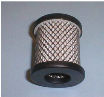
Figure 4.1: Inlet Filter P/N W117288

The inlet air filter removes the residual dust and the oil droplets. It extends the lifespan of the dryer desiccant material. The inlet filter holder is equipped with an automatic drain which evacuates the condensates.