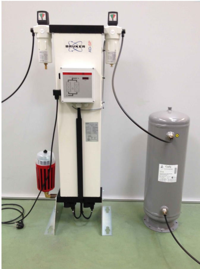
Figure 7.2: Dryer Outlet Connected to Buffer Tank